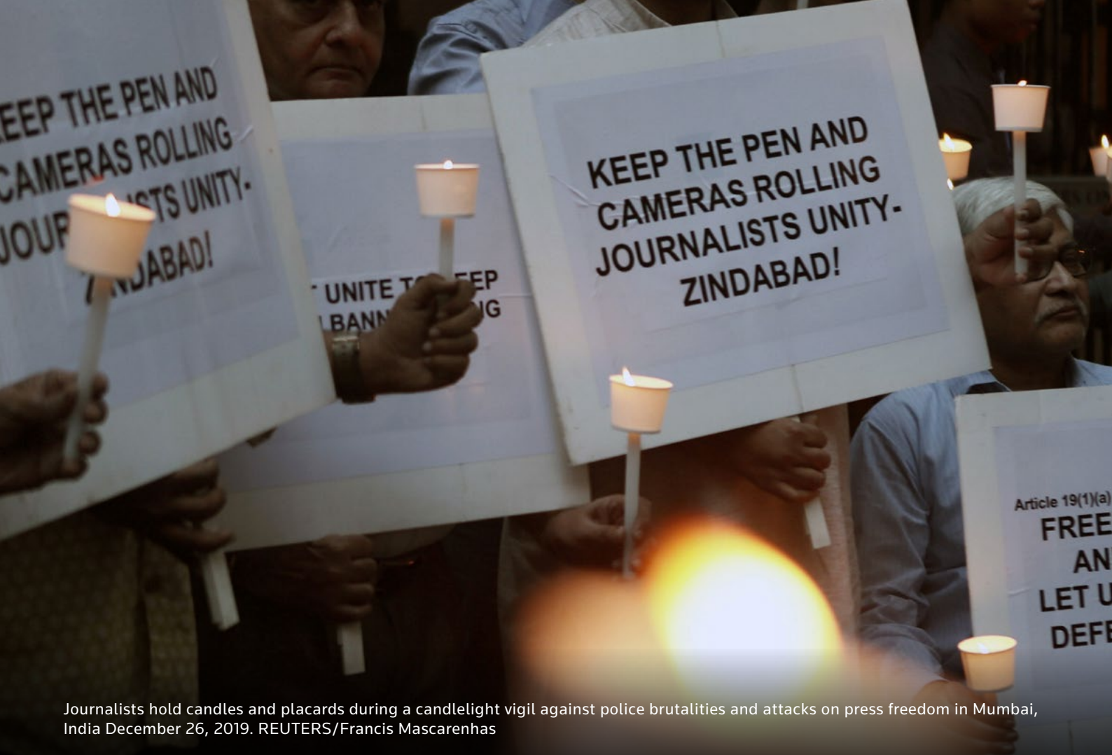
Journalists hold candles and placards during a candlelight vigil against police brutalities and attacks on press freedom in Mumbai, India December 26, 2019.